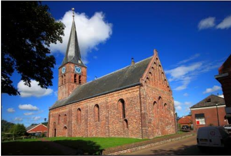
Reformed "Secessionist" (1834 Afscheiding) Church in Ulrum, The Netherlands